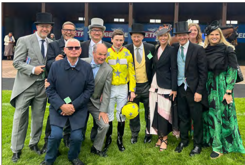
Connections of RELENTLESS VOYAGER before his win at Epsom on Derby Day

Night Sparkle was the third of a trio of seconds on the Saturday of Goodwood which began with Relentless Voyager , who was reeled in by Al Aasy in the Group 3 Glorious Stakes having dictated the race from the second furlong. An impressive winner of the Class 2 Handicap over a mile and half at Epsom on Derby day, Relentless Voyager showed that he handles a mile and six furlongs equally well when third in the Listed Grand Cup at York in June. He could head back over that course and distance in the Ebor, for which he is reasonably fancied in the betting. Third in last year's Italian Derby and only out of the placings once in his ten career starts, he should continue to provide his owners the Relentless Dreamers with good days at the track. Fairbanks was the next of the Saturday seconds at Goodwood,