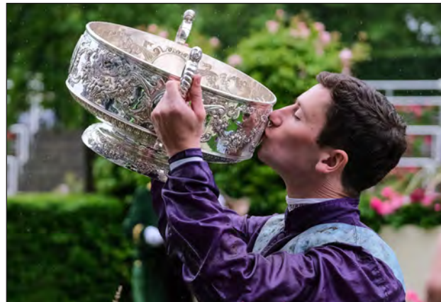
Oisín Murphy after winning the Coronation Stakes on ALCOHOL FREE