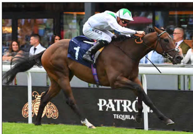
AL SHABAB STORM has won twice at Chester this term