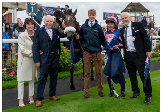
FLORA OF BERMUDA gained a deserved Group win at York in July