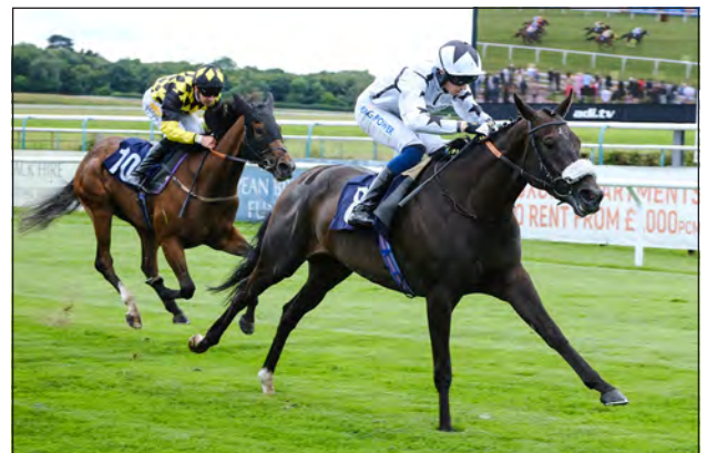
SUN DANCER GIRL has notched up a trio of wins this year