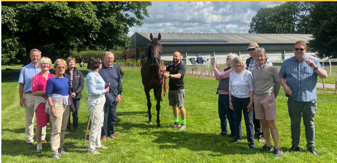
Members of the Club at the yard with MOUNT ATLAS

Our equine team for 2024 has a young look to it and we made a steady start to the campaign. However, a memorable across-the-card double, courtesy of Mount Atlas at Ascot and Lady Flora at Chepstow, has really kick-started our season – and a KRC party at Park House that evening was well-timed! Mount Atlas looks particularly progressive and could have some notable handicap targets later this year, while Lady Flora represented us well in the Racing League at Chepstow and looks to have plenty of improvement to come.