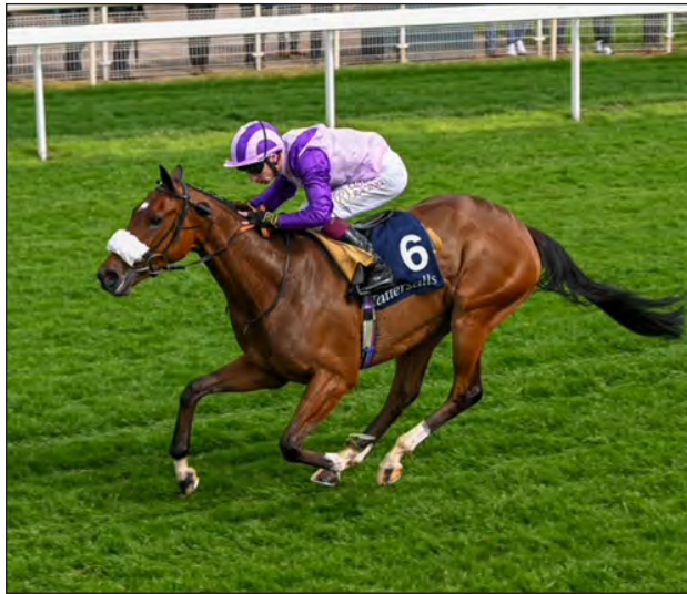
SECRET SATIRE provided an early season highlight when winning the Musidora at York

King Power's Bellum Justum completes the quintet of Goodwood seconds, having run Jan Brueghel close in the Group 3 Gordon Stakes over a mile and a half. Winner of the