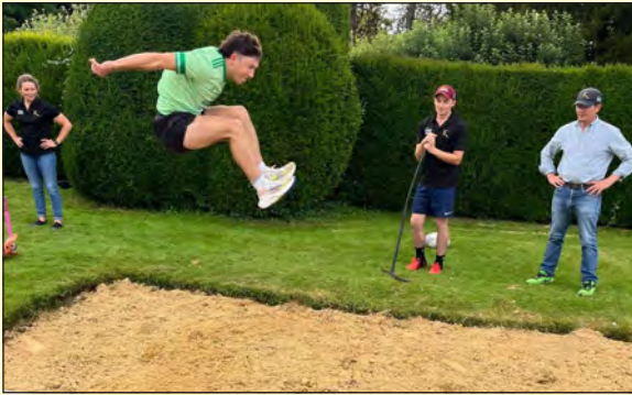
Above: The Park House team leapt into the second half of the season with some Staff Olympics

Front cover: Royal Supremacy was a dual winner last year and has performed with credit this term before selling to Australia