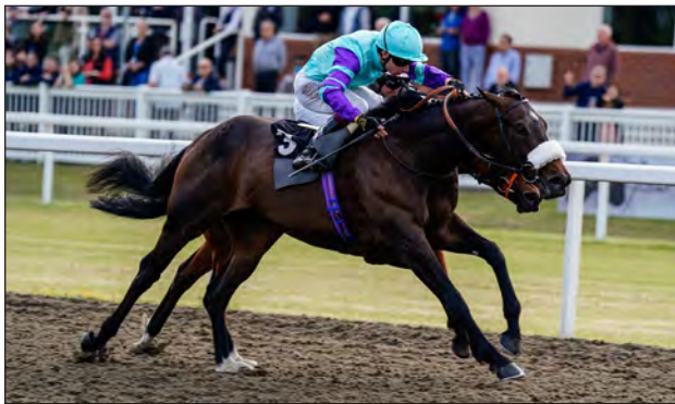
COOL HOOF LUKE won at Chelmsford before placing at Royal Ascot and Goodwood