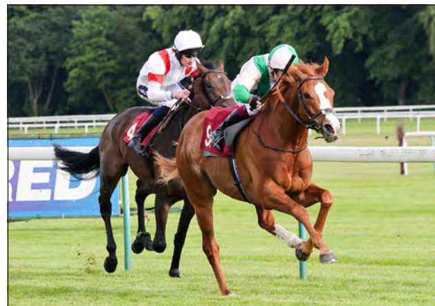
SUBSEQUENT is from the penultimate crop of Galileo and has already won twice this year