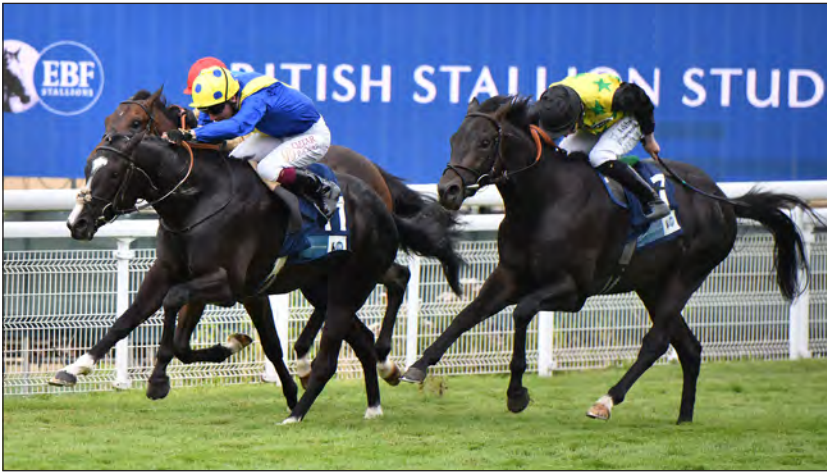
SPELL MASTER dead-heated at Goodwood for his first win

and The Foxes and hopefully Spell Master can continue to progress as they did. The seven furlong nursery at York could be next on his dance card.