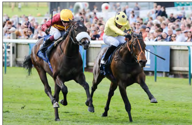
TROPICAL STORM is yet to win but has already been Group placed

Teme Valley Racing's Tropical Storm , a half-brother to Purosangue, came very close to giving us a juvenile winner at Royal Ascot, going down by a length to Shareholder in the Norfolk Stakes on his third start. This is strong form - he had subsequent Group 2 July Stakes winner Whistlejacket and subsequent Listed winner Aesterius behind him, and when finishing second at Newmarket on his previous start beat subsequent Listed winner Al Qudra and subsequent Goodwood nursery winner Mr Chaplin. These form lines saw him fancied for the Group 2 Richmond Stakes over six furlongs at Goodwood, but he did too much early on and failed to see out the extra furlong. He can bounce back and could drop back to the minimum trip in the Listed Roses Stakes at York, in which Purosangue finished second last year. Teme Valley Racing have had a juvenile winner from the yard in New Bombay , who bolted up on his nursery debut over seven furlongs at Chester earlier this month, appearing to appreciate the tight left-hand track. By New Bay and the first foal of a decent ten furlong winner, he seems likely to benefit from stepping up in trip in due course.