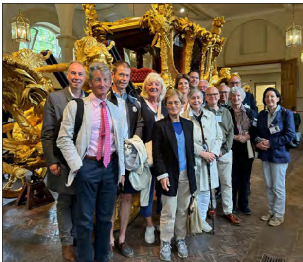
A trip to the Royal Mews has been a highlight away from the track

Our equine team for 2024 has a young look to it and we made a steady start to the campaign. However, a memorable across-the-card double, courtesy of Mount Atlas at Ascot and Lady Flora at Chepstow, has really kick-started our season – and a KRC party at Park House that evening was well-timed! Mount Atlas looks particularly progressive and could have some notable handicap targets later this year, while Lady Flora represented us well in the Racing League at Chepstow and looks to have plenty of improvement to come.