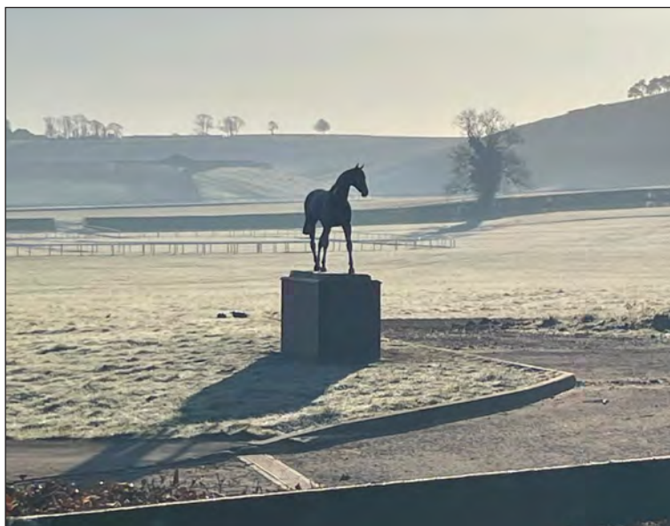
MILL REEF enjoying the view from his new location