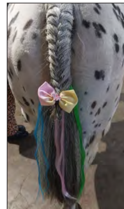
Deejay at the Grand National Weights Lunch, and showing off his unicorn tail!