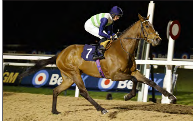
TURQUINO repaid his owners' patience at Southwell