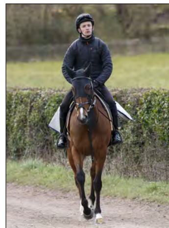
KASSAYA has the makings of a smart performer this term