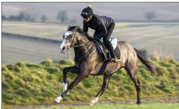
ALMERIC has done well over the winter