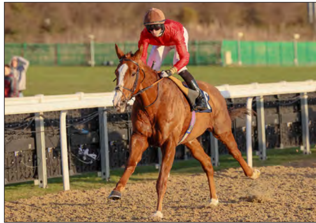
OLD HARROVIAN has flourished for a return to the All-Weather this winter