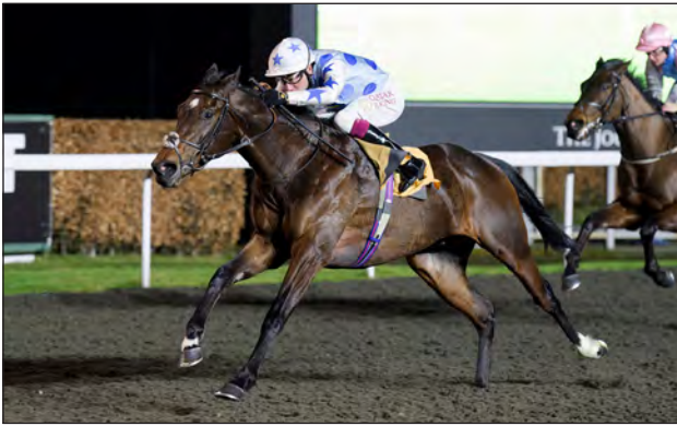
QUAI DE BETHUNE justified favouritism when winning at Kempton in January

with another winner when scoring over a mile at Lingfield in January under Callum Hutchinson, having gone close over the same course and distance the previous month. Out of Highland Pass, a half-sister to Phoenix Reach's best offspring Elm Park, Solar Pass is now eligible for handicaps off an attractive looking mark.