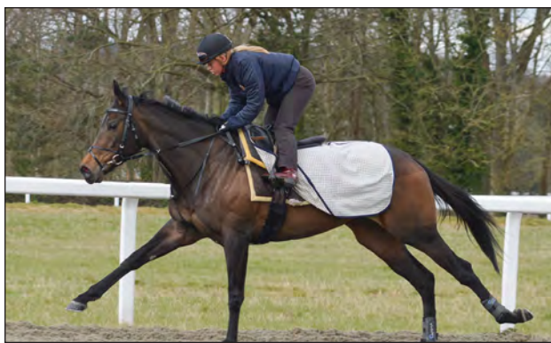
KALPANA has strengthened up further over the winter

Amongst the fillies all eyes will understandably be on Kalpana , heroine of last year's Group 1 British Champions Fillies & Mares Stakes at Ascot. Hugely progressive, she has strengthened up further over the winter and is looking great. There are a host of potential targets for Juddmonte's daughter of Study Of Man but the current thinking is that