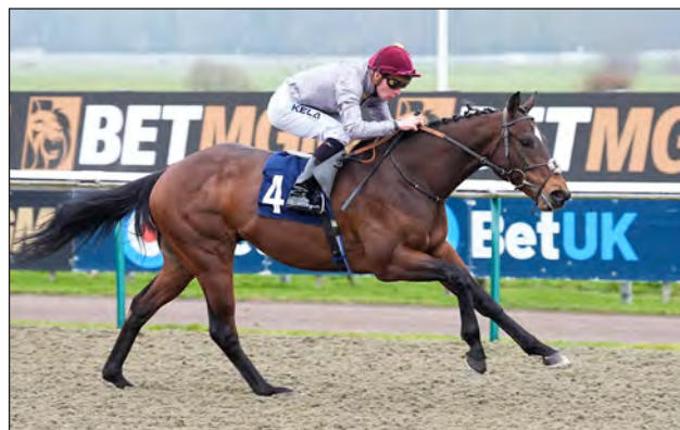
HUMAM has notched up two wins already in 2025