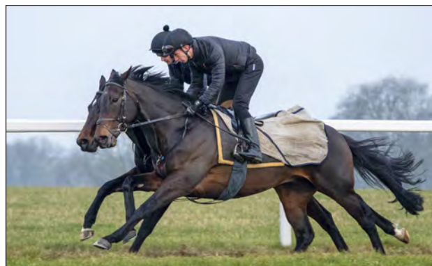
Half-brothers ARRAY and JOUNCY working on the New Gallop this Spring

Another returning from injury is King Power's Bellum Justum , big money winner in the Nashville Derby Invitational at Kentucky Downs in August but off the track for the rest of the year. He too is back in fast work and looking great. Effective over ten and twelve furlongs and able to handle a range of different ground conditions, he will have plenty of options this summer. Other older middle-distance horses with more defined targets include Kingsclere Racing Club's gorgeous Mount Atlas , who could head for the Rosebery Handicap at Kempton at the end of the month, whilst in the staying division Coltrane will aim for a third successive win in the Group 3 Sagaro Stakes at Ascot in May. He seems more than up for the challenge and, with form figures at Ascot reading 1212515, he could well be adding