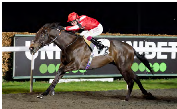
BERKSHIRE WHISPER is already a dual winner in 2025