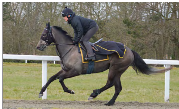
FLORA OF BERMUDA will look to build on a great season last year

she could take in the Group 2 Hardwicke Stakes at the Royal meeting, the Group 1 King George VI and Queen Elizabeth II Stakes back at Ascot in July, the Group 1 Yorkshire Oaks on the Knavesmire in August, and the Group 1 Prix de l'Arc de Triomphe at Longchamp in October. That is quite a to-do list, but she looks ready to take it on and we are all very excited to see what she can achieve. See The Fire won the Group 3 Strensall Stakes over nine furlongs at York in August and could drop back to that trip for her seasonal debut in the Group 2 Dahlia Stakes at Newmarket's Guineas meeting. Having run well over ten furlongs in the Eclipse, the Nassau and the Champion Stakes last season, she is likely to revert to that distance in due course. The Nassau is firmly etched in her diary, but she could also try twelve furlongs at some point during the season. It's pretty certain that Flora Of Bermuda won't be trying twelve furlongs any time soon, having proven herself a talented sprinter with a win in the Group 3 Summer Stakes at York and a marvellous third in the Group 1 British Champions Sprint. The Group 1 Queen Elizabeth II Jubilee Stakes on the final