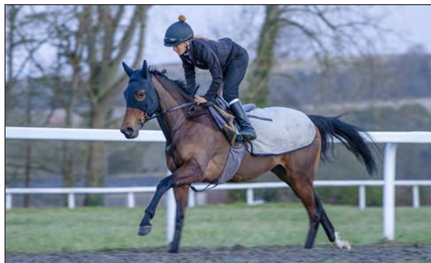
FORMAL is an exciting addition to the yard following the retirement of Sir Michael Stoute

Juddmonte's Windlord holds entries in the Irish 2,000 Guineas and the Derby. He is not guaranteed to stay the Derby trip on his pedigree but shaped as if he might when winning a mile Novice at York by over five lengths and when finishing third in the Group 2 Beresford at the Curragh over the same trip, behind two subsequent Group 1 winners. His early work this Spring will help inform the path he takes but the Classic Trial at Sandown could be on his agenda. Royal Playwright has the same advanced entries as Windlord and similarly smart form in the book, having finished second to Wimbledon Hawkeye in the Group 2