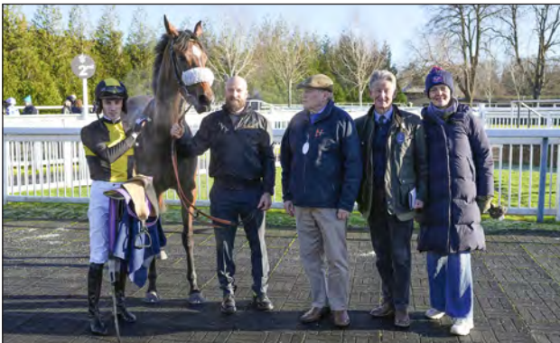
KRC members with SOLAR PASS, a winner from the last crop of Phoenix Reach